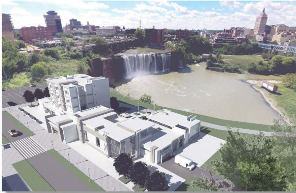
Design by Yao Yao